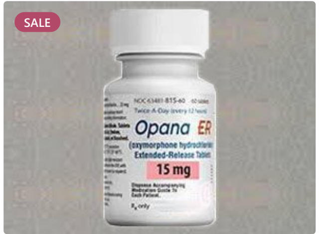
Opana ER 15mg